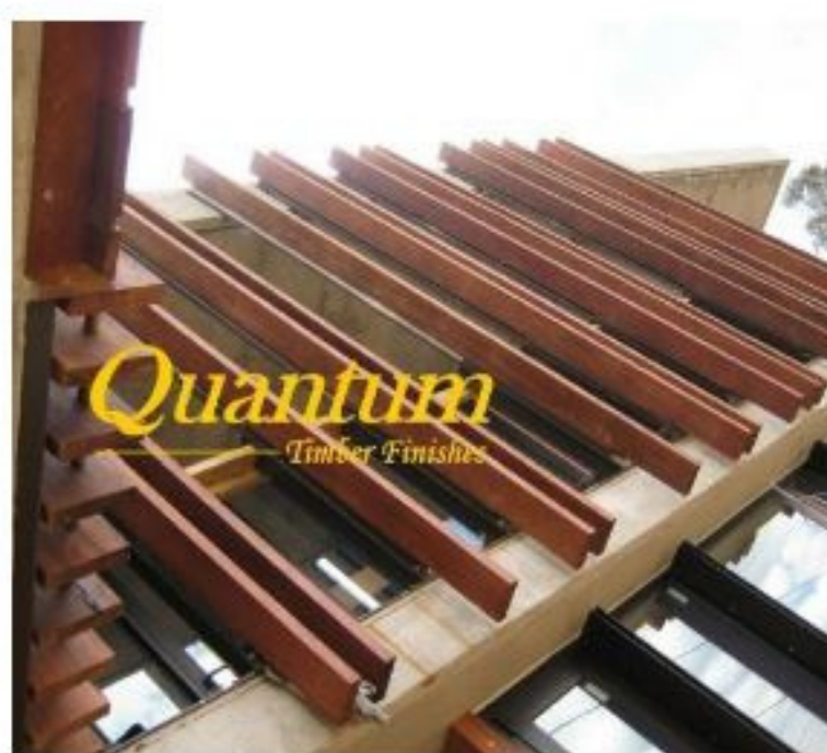
Facade Screen - TIMBRE PLUS VERTICAL

If TPV has already been previously applied - to renew the finish, simply hose off dust, dirt or salt and apply one good coat of TPV. Note: if the coating has eroded back to bare timber then a timber cleaner will be required. For more information see our TIMBRE PLUS VERTICAL datasheet and label.